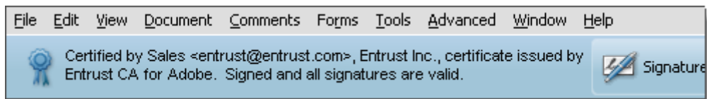
Figure 1: Blue ribbon and information bar (authenticated)

If the document has been altered by an unauthorized user, Adobe Reader or Adobe Acrobat displays a red X and a message indicating that the PDF should not be trusted